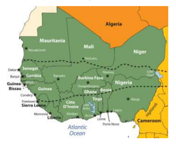
Figure 1: The Map of West Africa<sup>40</sup>

As part of the African continent, West Africa experienced civil wars, specifically during the Cold War. As a continuation of this fact, the security structure has been based on state-centred military rule, which is paradoxical, including the lack of state authority: such condition comprises Westphalian-style security and post-colonial territorial disputes.<sup>41</sup> However, the interferences between other's civil wars have left its place for international peace with domestic wars<sup>42</sup> because there is a regional hegemony attempt in the region.